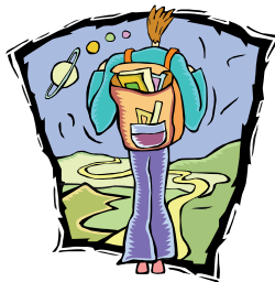
Roy Muise CPS Peer Support Worker