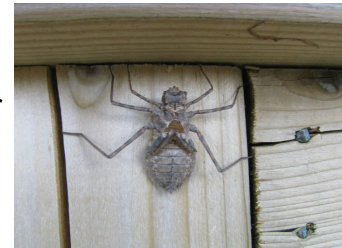
Dragonfly Nymph Shell

Eventually it crawls from the muddy water to the top of a reed or up on a rock. At last after the final shedding, emerging with a long slender body and gauze-like, iridescent wings, it is the beautiful dragonfly. Because of this transformation, a whole new life style is now possible. It breathes air, feels the sun’s warmth and it flies! But....was it any ‘less’ of this beauty as it struggled to come to the surface of life and be free?